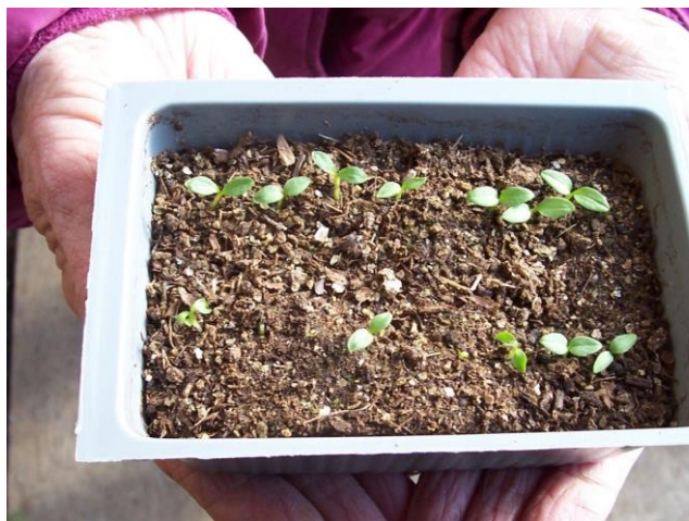
Pasque flower seedlings; three in bottom row still coming up.

A favorite spring flower that the peasant likes to share is the pasque flower. It blooms early to provide its lovely color and when the blooms have faded its fluffy seed heads continue to beautify the plant all during summer. If you grow the pasque flower, you'll discover that it likes some space and more aggressive plants encroaching on it will cause it to lose vigor and eventually to die out. Keeping an open area around the plant will allow it to thrive and make it stand out.