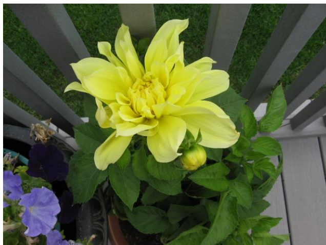
Photo of Dahlia