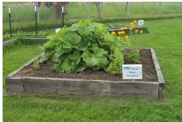
Master Gardener Bed at the Experiment Farm

Master Gardeners. It needs to show this ability. Thanks folks.