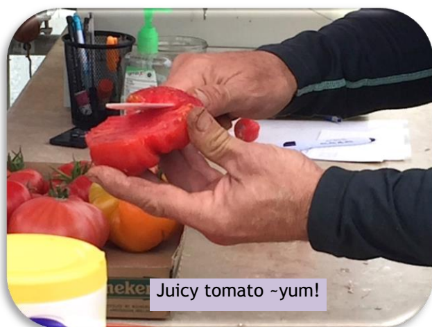
Juicy tomato -yum!