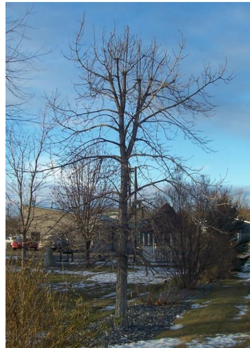
This bur oak grows near the MEA complex in Palmer. It's a thriving specimen. Some top pruning was done because a power line is near the tree. This does distract from the natural beauty of the tree, and further pruning will become necessary as the tree continues to grow.

If anyone wants to experiment and grow an oak that has brilliant red fall foliage but may or may not make it in Alaska, the peasant has some to give away that have a good start. Incidentally, it is worth a few minutes to wander through the MEA arboretum and have a look at the trees.