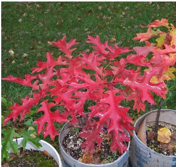
Fall foliage on container-grown northern red oaks.

The order came in and contained eleven healthy bare root seedlings of varying sizes, all of them having long tap roots. It is recommended to leave the tap roots intact to prevent possible loss of the trees. It became necessary to improvise by planting some of the trees in the cardboard tubes ordinarily used for pouring concrete pillars. The peasant cut the tubes long enough to accommodate the tap roots. Others were planted in various containers to suit the tree size. All survived and grew well during the summer. The peasant was concerned that the leaves had sharp pointed lobes; not the rounded lobes characteristic of bur oaks. Perhaps, he surmised, this was a subspecies with pointed leaves.