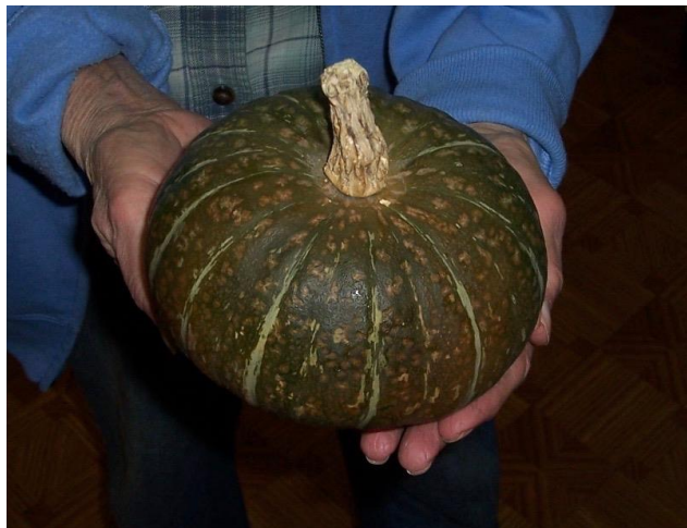
Chacha squash. A kabocha type it comes to us by way of Japan. it has an orange smooth flesh and has a subtle sweet flavor.

spoilage has been experienced when the fruit contacts moist soil.