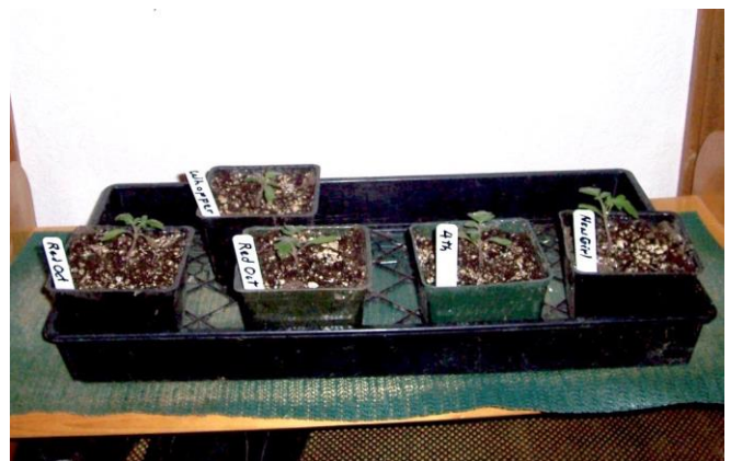
Some of the peasant's 2020 tomato crop. These were seeded on January 2nd and transplanted to four-inch pots on January 18th. Photo taken on January 20th.