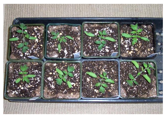
Tomato starts photo taken January 22.