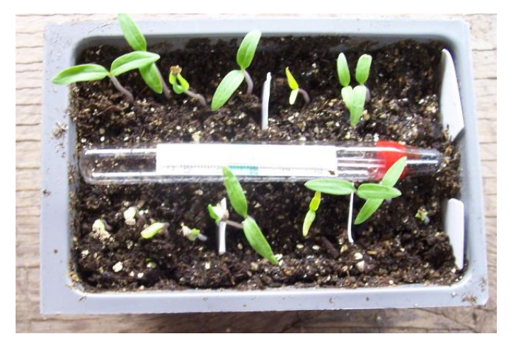
2014 tomato starts. Seeded January 1, photo taken January 6