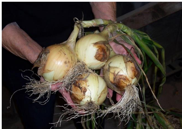
Ailsa Craig Onions

We are fortunate in having so many choices in flowers and vegetables available. Many of the old favorites continue to do very well and new hybrid varieties also. A beef the peasant has with some seed companies is that they'll come out with a new variety that does extremely well and then suddenly it's no longer available. There will be a replacement that will require a trial and it may not do as well. Johnny's is noted for that, but they do have a tremendous selection. Denali Seeds carries many varieties that fit Alaska's growing season. Pine Tree, Territorial, Stark, Park, Burpee, Veseys, Stokes, and more, are good suppliers, online or by mail order or call-in. The peasant likes Stark for high quality strawberry plants. Sharing an order with a couple of friends reduces the cost per bundle and shipping too. A ship date may be requested.