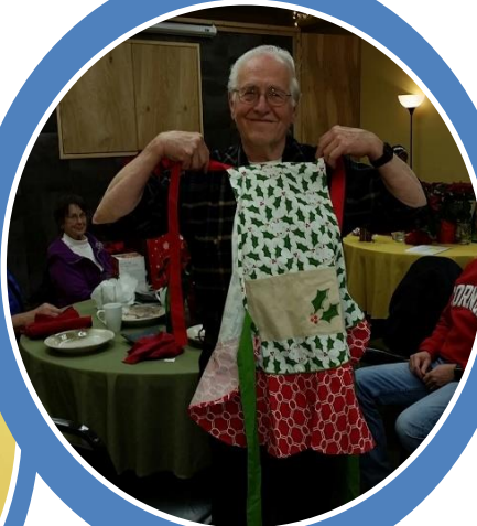
Christmas Party Gift Exchange