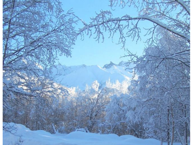
High noon on Lazy Mountain. A photo doesn't do it justice, but we try.