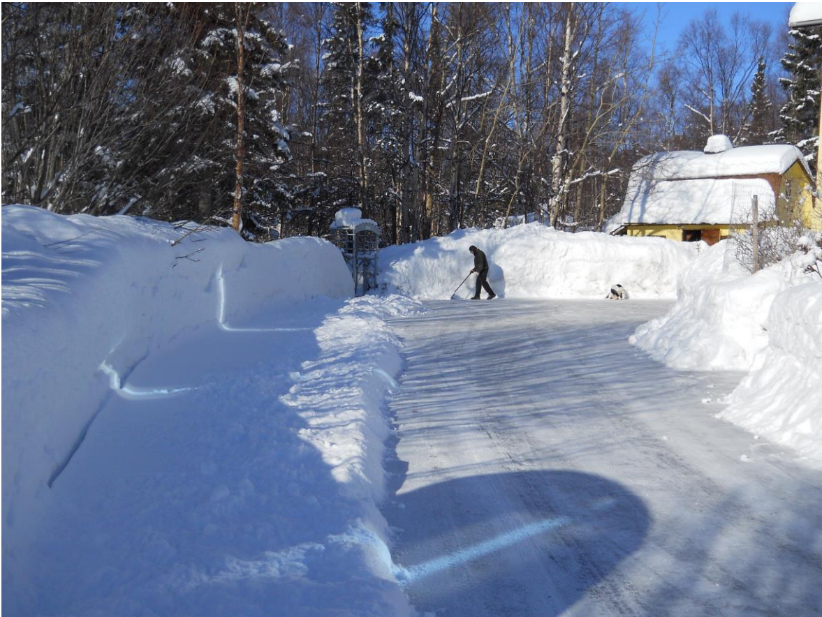
Perhaps the snow will come.