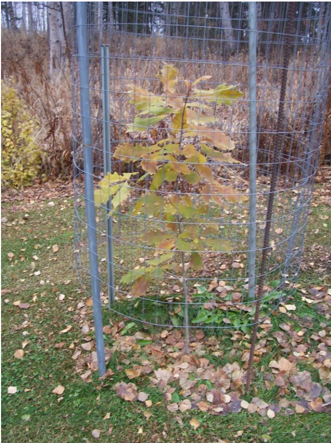
Bur oak as of 2021 autumn. Leaves were just changing color. There were an estimated sixty leaves as opposed to estimated 150 at present. Leader shows small leaves which may be a factor in winter dieback. All leaves dropped in autumn, which indicates they had time to mature. Birches were already dropping leaves when photo was taken.

The peasant wrote about his bur oak last year and has a couple of new photos to show its progress. It did suffer some dieback on most branches during a fairly tough winter, but it's coming back strong and looks great. It takes some time for it to adjust itself to our climate and its location, but it appears to be doing that. It has been in its permanent location for two winters.