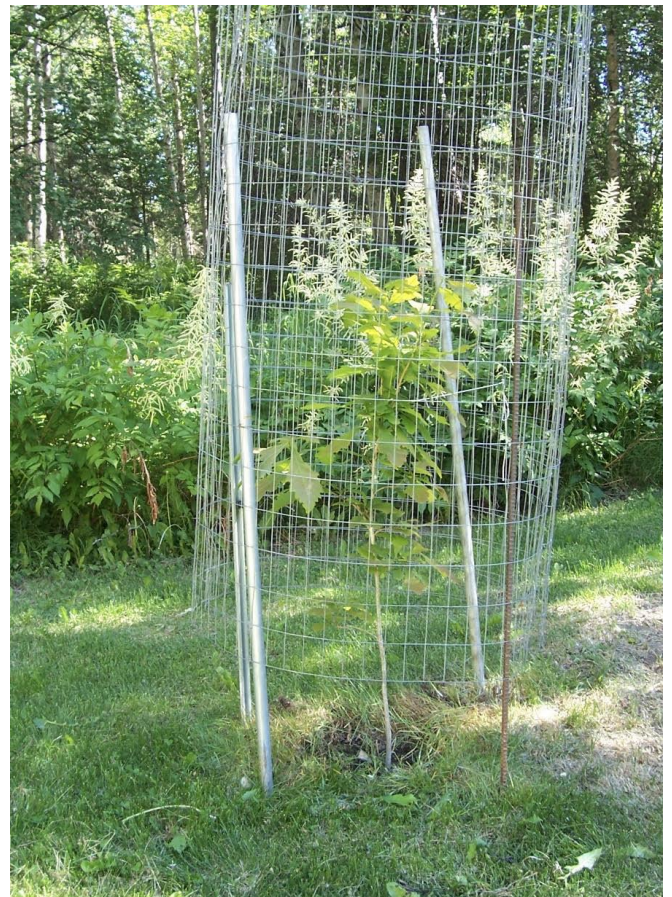
June 20, 2022, photo of peasant's bur oak. It is thriving and has an estimated 150 leaves, most not full-sized yet. Background plumes are on goat's beard hedge.

The bur oak was bare root when first acquired and was grown in a five-gallon bucket for two years to allow a good root system to develop. It was laid on its side during winter and mulched over with leaves and snow. This method is used on bare root stock and seems to work well. The pot is set in a sunny place where the soil in the pot can warm, promoting good root growth. Usually, a plant can be set out the following spring if it has made sufficient growth. Fall is a good time to transplant as the soil has warmed and if done early enough the tree or shrub has time for the roots to make some growth.