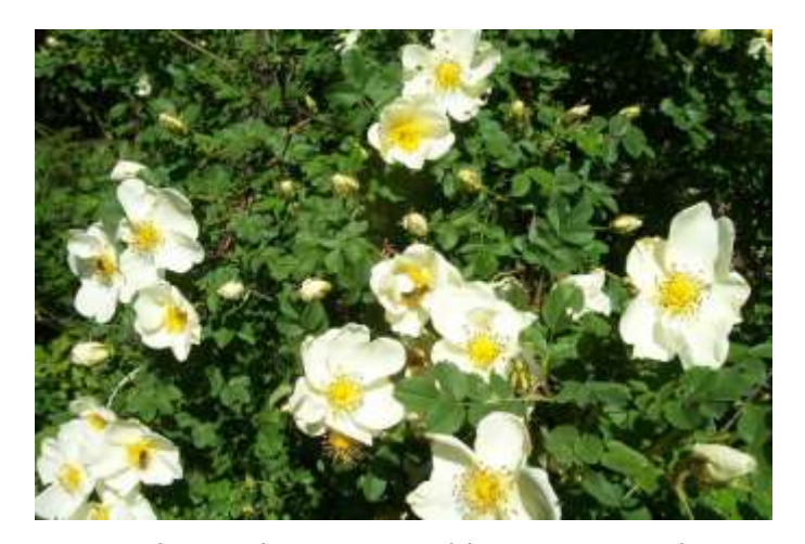
Scotch Rose beginning to bloom. It is another favorite of honeybees.