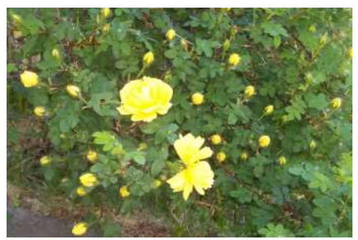
First flowers on Harrison's Yellow Rose