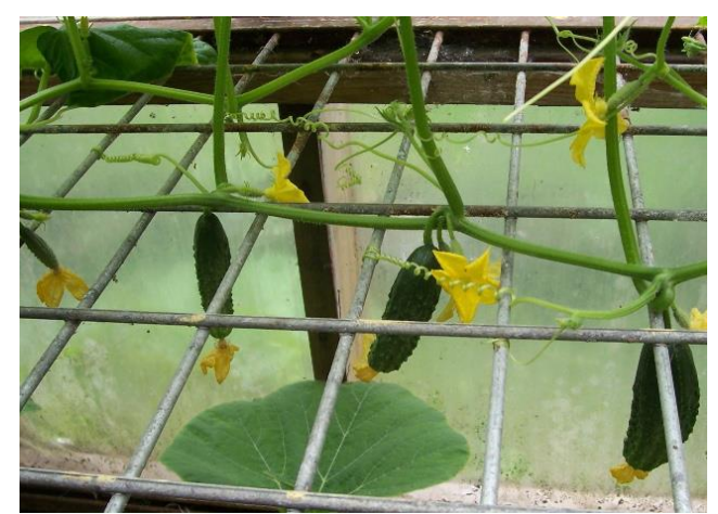
Fruit set on Excelsior pickling cucumber. There are eighteen fruits on a vine three feet long.

become available with various characteristics in fruit type and productive capability.