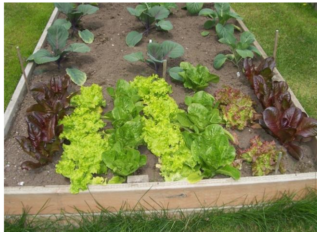
One of Marge's lettuce plantations. These were started in the greenhouse. Marge has already direct-seeded more in the garden. Once this bed is harvested it can be direct-seeded as well.

Marge is the expert on growing lettuce. She makes sure we have an abundance of various varieties to supply our tastes throughout the growing season. There is such a myriad of types and varieties available in appetizing colors and they all grow well in our climate. Marge starts lettuce transplants in the greenhouse and direct seeds in the garden during the growing season.