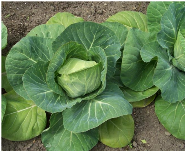
Parel cabbage as of June 20, 2017. Another week and it'll be ready for harvest. Note the close spacing of the plants, a condition the variety tolerates well, and becomes a real plus for commercial growers, increasing per acre yields.

The peasant strives to lengthen the vegetable growing season on both ends. Timing of seeding transplants and choosing cultivars that mature early are a couple of ways to speed up an early harvest. A very early cabbage that is of high quality and one that the peasant has grown for several years is Parel. A few seeds planted in the latter part of March and grown in three or four inch pots until transplanting to the garden will then be mature in four to six weeks. The variety makes compact round heads of three pounds or so and four plants will hold without splitting and suffice until later varieties mature.