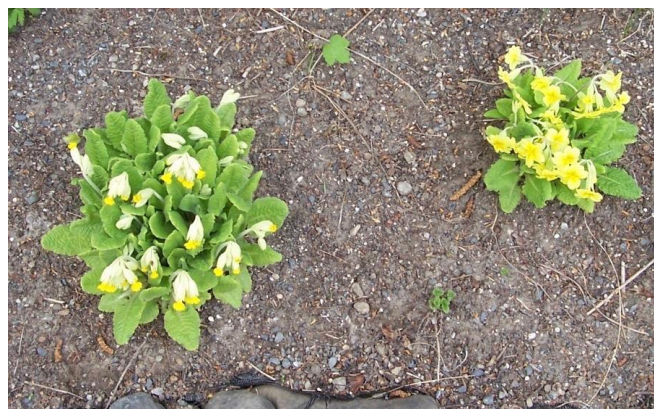
Primroses are a welcome sight as they start to bloom. On left is cowslip [ Primula veris ] and right is often called English primrose [ Primula vulgaris ].