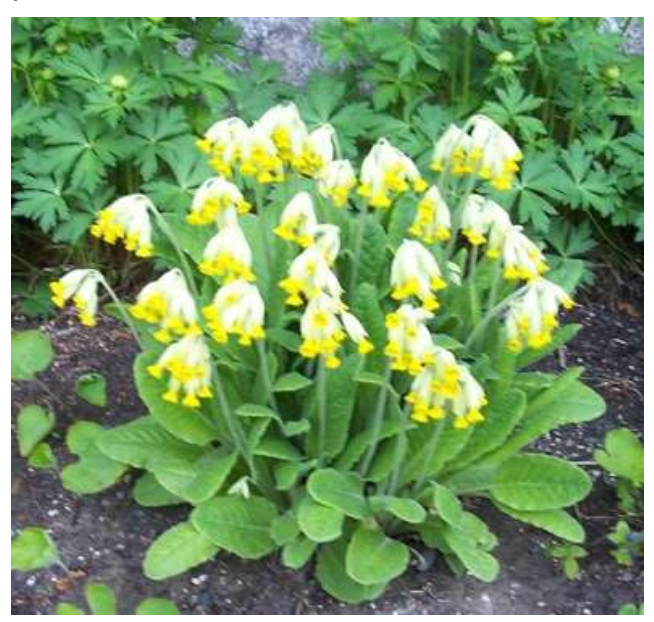
Primula veris [Cowslip]

spreads somewhat but not invasively. It is easily propagated by dividing the plant or digging the offshoots. The cowslip and common primrose may also be divided if you have the heart to disturb a beautiful plant.