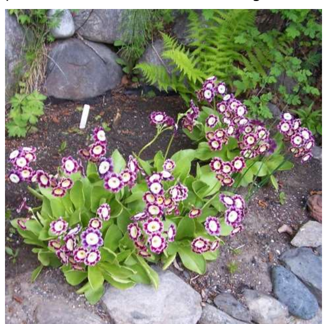
Primula auricula [Primrose auricula]

Primula auricula is dependably hardy in our area, as are Primula veris and Primula vulgaris. Primula auricula has many cultivars. The original ones come from the mountains of central Europe, and many striking colors have been developed from the original primrose. Primula veris is a native from England and is commonly called cowslip. Primula vulgaris is called simply primrose or common primrose or English primrose. It is another native of England.