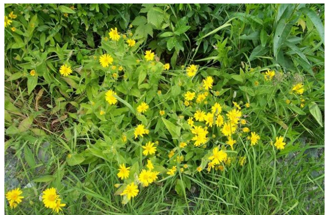
Meadow arnica growing among other plants in moist roadside ditch.