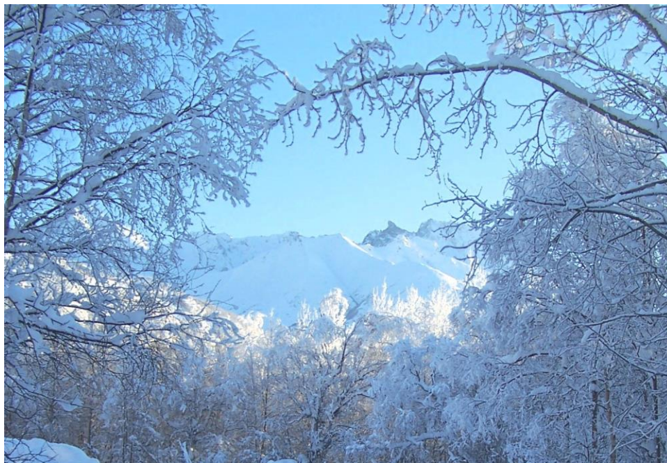
Window on winter's world