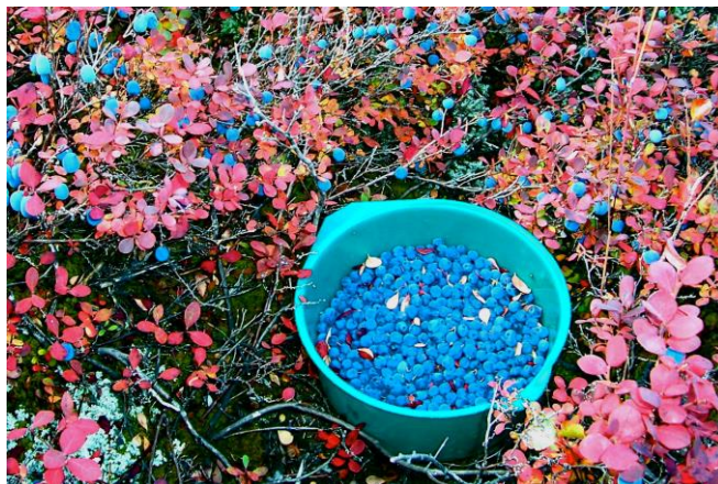
Nature's bounteous harvest

The peasant has thrown in a couple of scenes, one wintry and one of summer - may you enjoy them. Thanks, folks.