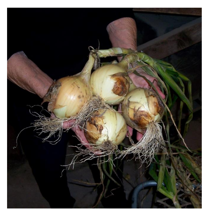
Ailsa Craig onions at harvest time.

Favored varieties are Patterson, a yellow storage onion, Redwing, a red onion that stores well, and Ailsa Craig, a large onion that for us has stored well into January.