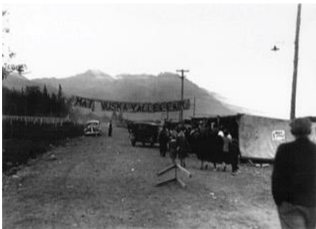
1936 Alaska State Fair

First established in March 1936, the Matanuska Valley Fair eventually morphed into the Matanuska Agriculture and Industry Fair coordinated by the Northland Pioneer Grange No. 1. Held in the location of the current Borough building, the first fair coincided with the opening of the Knik River Bridge and included such events as boxing matches, sack races, a rodeo, and a rumored manure spreading contest. There were hundreds of agricultural entries, including grains, cabbages, and fodder. Hotdogs, root beer, and popcorn were sold.