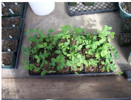
Sweet peas in three-inch pots. They have been topped once and are filling out nicely. They may need to be staked. They will be planted out when the soil has warmed and can tolerate light frosts.

Last month the peasant wrote about his efforts to improve germination on sweet peas. Observing the results, the best ones were in seeds that had been soaked for four to six hours with no nicking of the seed coats. Soaking the seed overnight softened the seed too much and handling the seed then became a problem. Some seed remained impervious and could be nicked. For future growing of this plant with the colorful and fragrant flowers the peasant has decided to make it easy on himself and just go with soaking seed for four to six hours. Starting the plants early and pinching the tops to help the plants bush out will be a good way to do sweet peas.