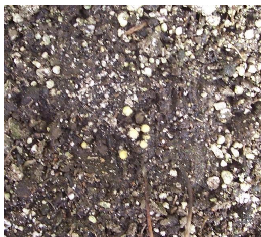
New shoots on overwintered white fireweed. There are seven shoots shown here. More may appear later. This plant should be quite showy by mid-July.

Obtaining seed may be difficult. There are sources online at varying cost. The peasant should have a limited amount available by next fall [he hopes] and will be happy to share.