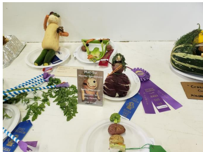
Some of the Division 16 Veg Head entries