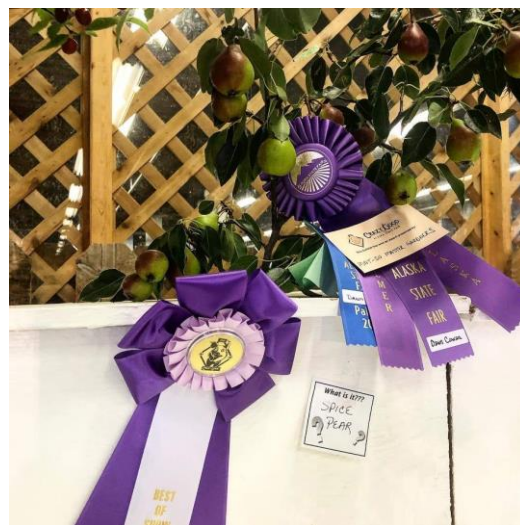
Dawn Cowan's Division 5 entry