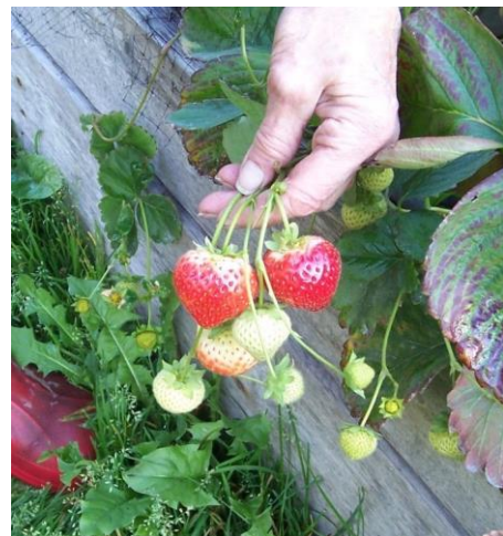
These are typical fall berries. Many will be extra-large with a white core. It's a bit sad to see all the berries setting and knowing that they'll never be edible. The variety is Albion. Other varieties behave in a similar way. Containers moved into a greenhouse might help extend the season.