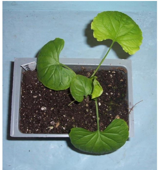
Sweet white violet plant [ Viola blanda ]

what was needed. The single plant did grow slowly, and in late July was joined by another seedling. The second seedling was separated to its own pot and the root system checked on the first one. It was extensive and the seedling was moved to the center of the container. It was observed at that time that the plant had produced a couple of stolons.