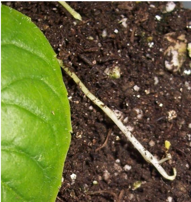
Stolons on Viola blanda , at top left and center.

Next spring a permanent site will be chosen and the violet will receive a home. The violet will need to be protected from encroachment from other plants which are more vigorously adapted to Alaska. Perhaps a wood frame with a landscape fabric bottom can be set into the soil and the violet planted within; the frame would be large enough to allow the plant to spread. It can then be covered with leaves each fall, as would happen in its natural habitat. This violet should prove hardy here once it is established. Thus, the peasant indulges nostalgic urges.