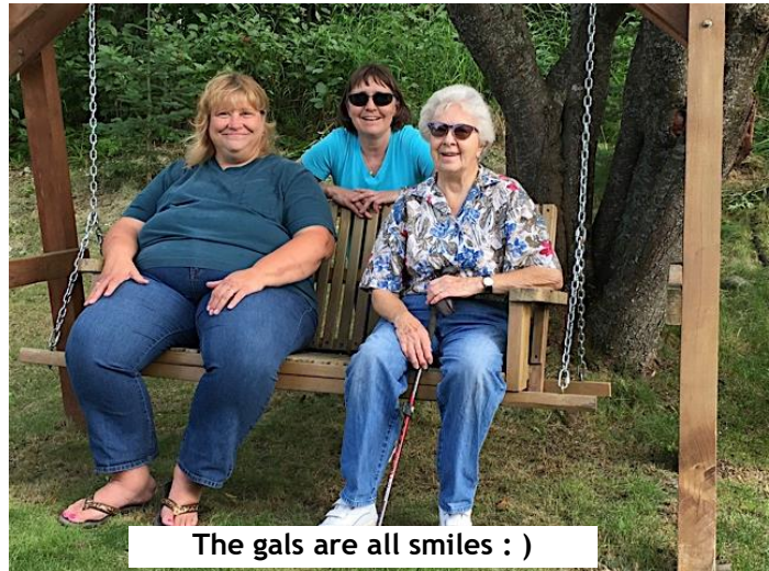
The gals are all smiles : )