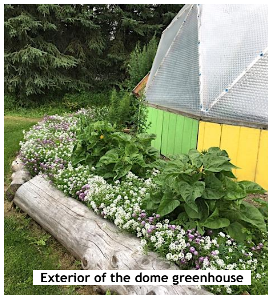
Exterior of the dome greenhouse