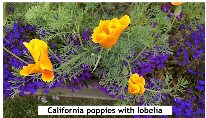
California poppies with lobelia