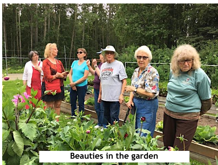
Beauties in the garden