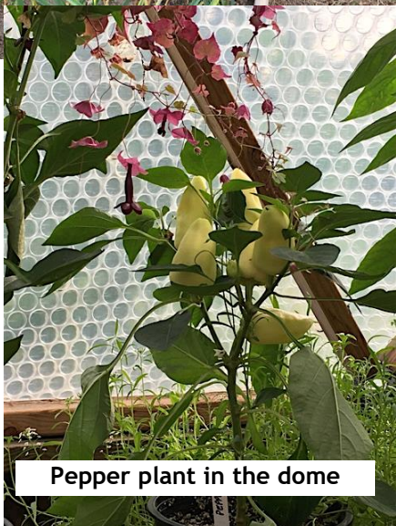
Pepper plant in the dome