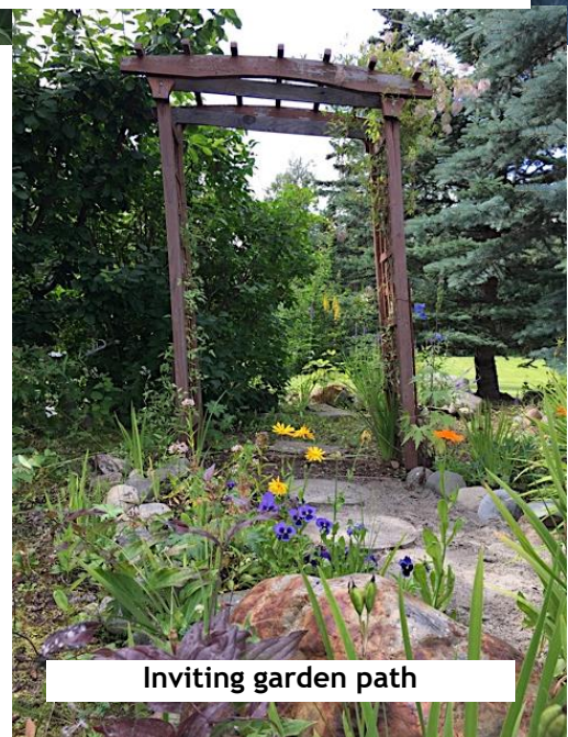
Inviting garden path