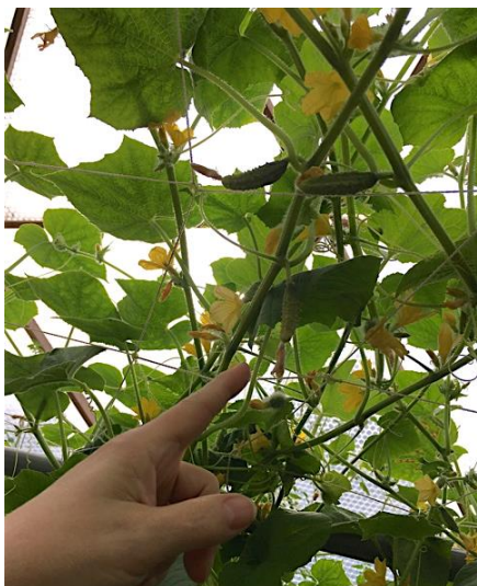
Pickling cukes in the greenhouse

Last stop on the tour - Ken & Deb Blaylock's garden and greenhouses.