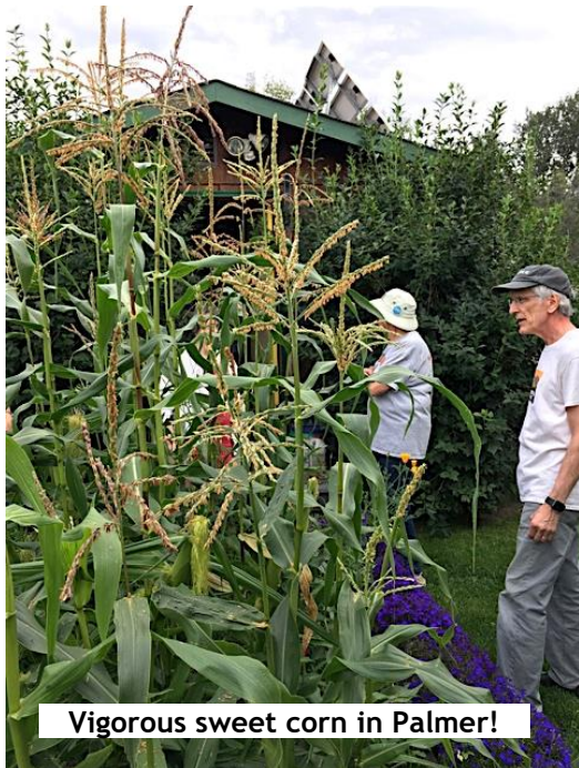
Vigorous sweet corn in Palmer!