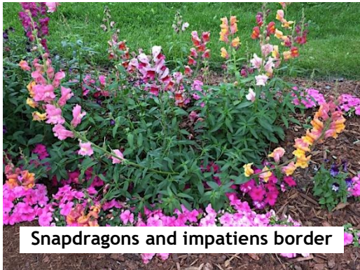
Snapdragons and impatiens border