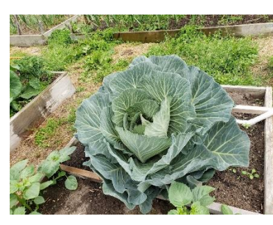
Head is forming nicely! Jul 19