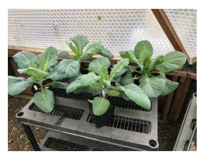
Moved out to greenhouse - Apr 21