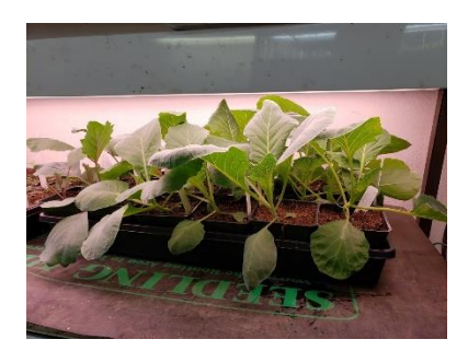
In the 3x3 pot - Mar 25