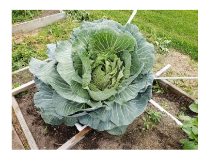
She's still growing! Aug 9