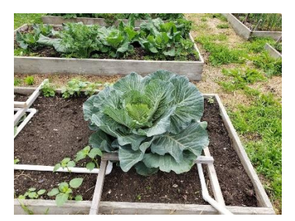
Moved to raised bed - Jul 12