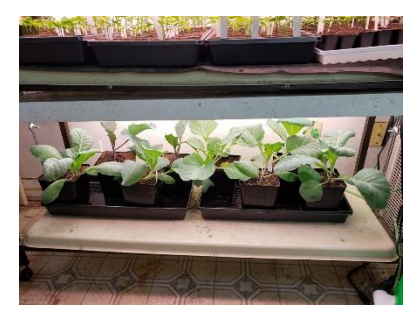
Into a ½ gallon pot - Apr 3