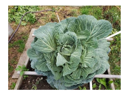
and growing! Aug 24

Planting was delayed because of the fair cancellation. Learning of the possibility of a weigh-off, the cabbage was finally planted in July. She was growing nicely and then Mr. Moose discovered the garden on Aug 2<sup>nd</sup>. The electric fence was then fixed and charged. Several days later, "Scar Face" arose from the ashes of disaster. She continues to grow - a bit subdued from her former glory days. She will go to the Harvest Fest weigh-off on September 3<sup>rd</sup>.