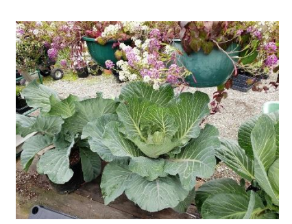
Growing & growing! Jun 9