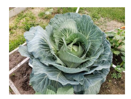
Ain't she purty! Jul 28