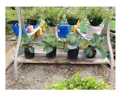
Moved outside and into 3gallon pots - May 19