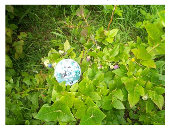
This is a Chippewa blueberry. Soil PH for these berries was dropped to 5.5 according to an electronic soil tester. The label in photo reads 'Chippewa half high'.