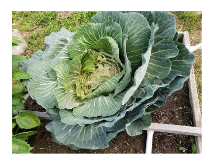
Moose attack!! Aug 2