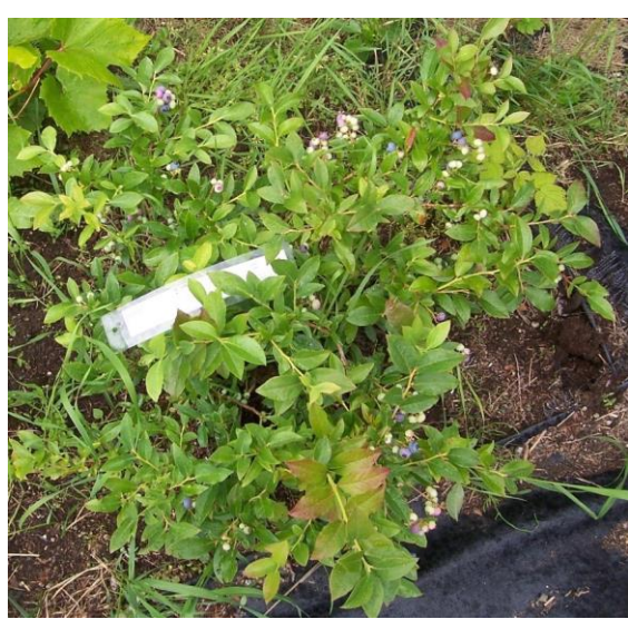
This is an example of Dawn's Northblue blueberries. They've already been picked a couple of times. Visible in the upper left corner are leaves from a grapevine.

The accompanying photos will help to round out this essay. Thanks, folks.