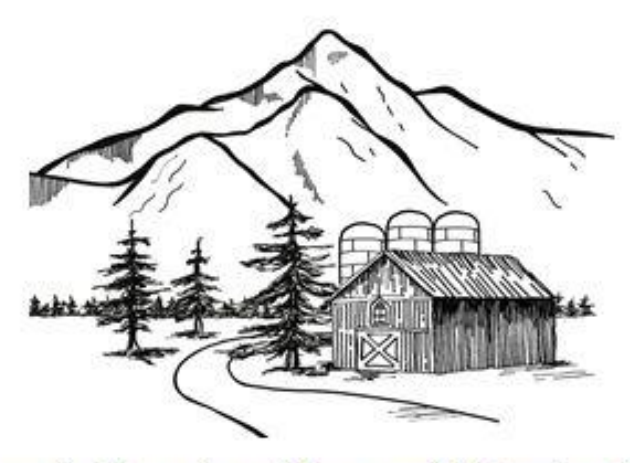
Matanuska Experiment Farm and Extension Center CLASSES - August Theme is: Let's Get Crafty September Theme is: Harvest