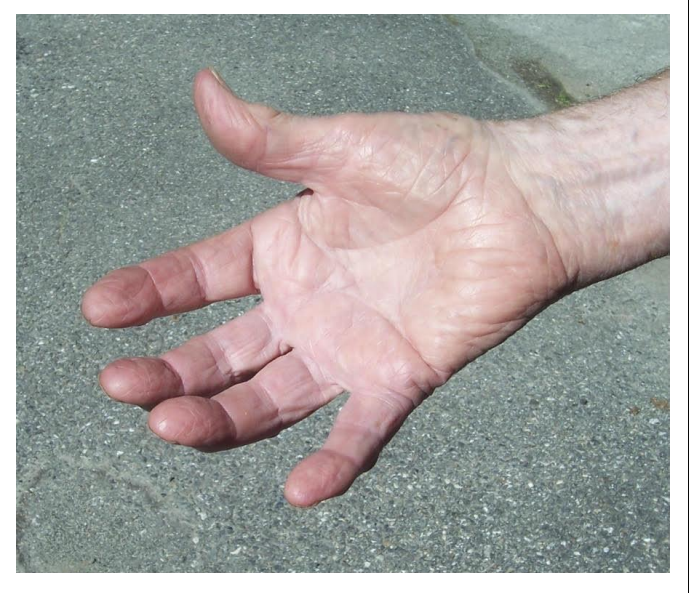
The peasant's favorite gardening tool. Without this nothing else works.

It has been interesting to see you folks' favorite garden tools. The peasant has given some thought to this, and the accompanying photo shows his idea of a favorite garden tool. Some of you might agree with this, but please keep on showing your choices of inanimate or animate tools.