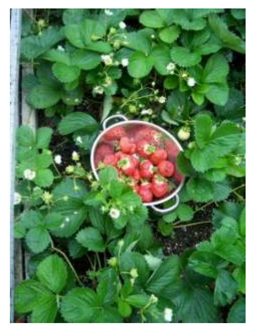
It's the berries