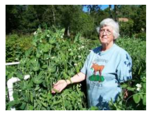
Let there be peas